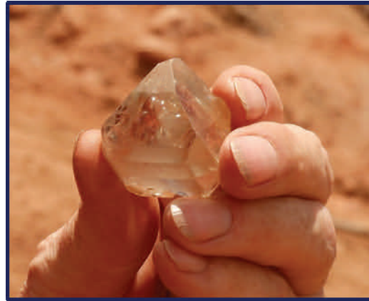
A large topaz crystal from Colorado mountains!