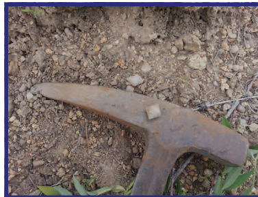
Beta quartz crystals

Members look for all kinds of minerals, rocks, and fossils. Most trips are close to home and are adapted for all levels of digging and learning. In some cases, you just need to bend over and pick up the minerals and fossils!